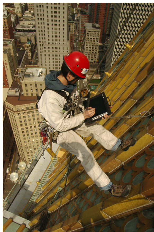
TPAS in the field

Successful repair or rehabilitation projects depend on the efficient collection of data during the discovery phase. Because final decisions are made based on the evaluation of existing conditions and quantities, the documentation of these conditions must be reliable and in a format that is usable by the entire project team. TPAS®, the Tablet PC Annotation System, was developed by Vertical Access for direct-to-digital documentation of existing conditions, streamlining the collection of accurate survey data and providing enhanced analysis of survey results.